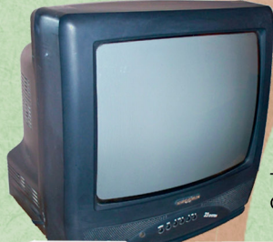
TV'S AND COMPUTERS