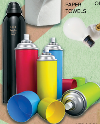
AEROSOL/PAINT SPRAY CANS

STRAWS AND PLASTIC UTENSILS GO IN THE TRASH - THEY ARE NOT RECYCLABLE